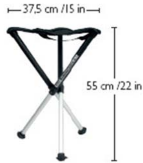
Walkstool Comfort 55 XL 800 g / 28 oz Max 225 kg / 495 lbs