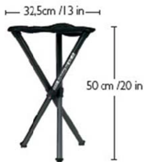
Walkstool Basic 50 M 650 g / 23 oz Max 150 kg / 330 lbs