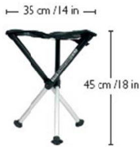
Walkstool Comfort 45 L 725 g / 26 oz Max 200 kg / 440 lbs