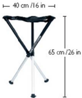
Walkstool Comfort 65 XXL 850 g / 30 oz Max 250 kg / 550 lbs