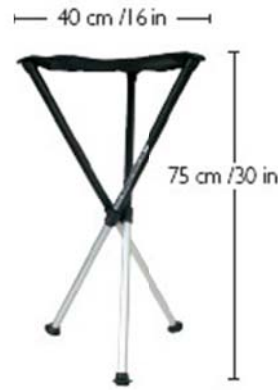
Walkstool Comfort 75 XXL 900 g / 32 oz Max 250 kg / 550 lbs