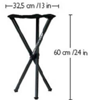
Walkstool Basic 60 M 725 g / 26 oz Max 175 kg / 385 lbs

Patented US Pat.no. 5,851,052/6,135,557 Australia no. 749.687 Brazil no. 9812952-0 Canada no. 2.306.180 China no. ZL98810406.7 Germany no. 69814128.8-08 France, Italy, Spain and UK no. 1024731. Japan no. 4237397